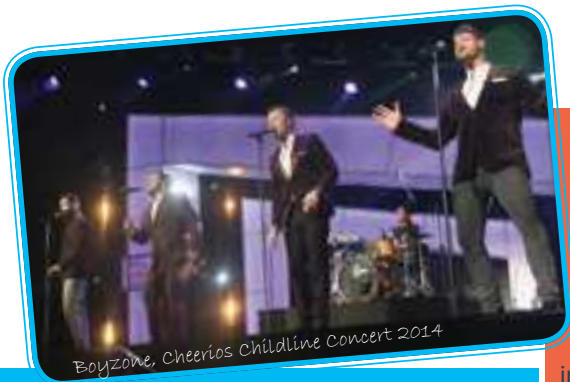
Boyzone, Cheerios Childline Concert 2014