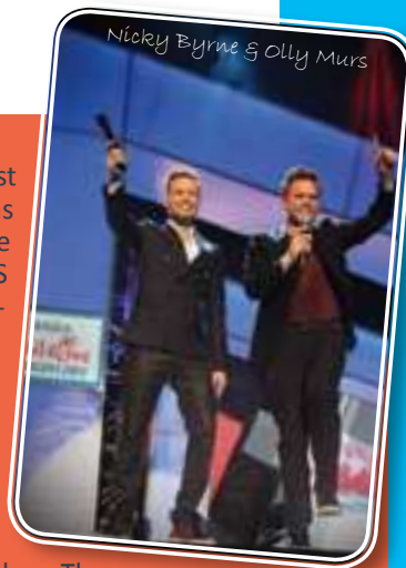
Nicky Byrne & Olly Murs

Nicky Byrne hosted the event and the line-up included Olly Murs, Shane Filan, McBusted, Jedward, Hometown, Ryan Dolan and Fresh Re. Over the years, acts such as Robbie Williams, Westlife, The Script, JLS, The Wanted, Alexandra Burke, Girls Aloud, Taio Cruz, Enrique Iglesias, All Saints, Ronan Keating, Brian McFadden, S Club 7, Blue, Sophie Ellis Bextor, Five, Sugababes, The Saturdays, Little Mix, Jason Derulo and many other big names have shown their support by performing. Thanks to CHEERIOS, O2 Arena and MCD. CHEERIOS Childline Concert, you'll be missed!