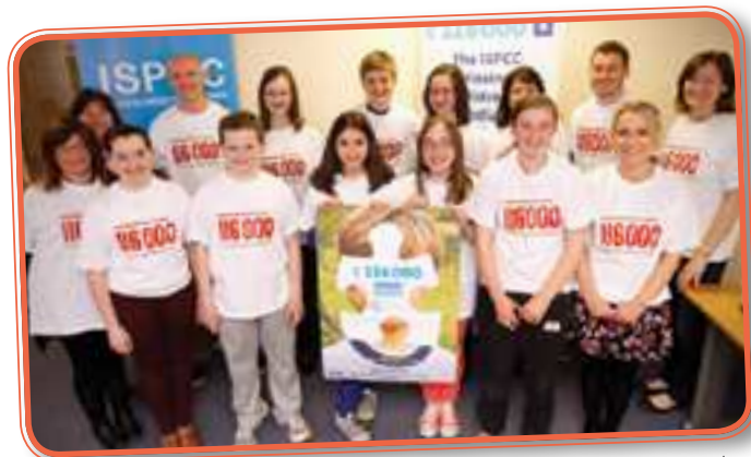
CAC Cork promoting the Missing Children's Helpline

Dublin. In 2014, the Dublin CAC were once again enormously helpful in assisting the ISPCC in meeting our aims and objectives. They were involved in the development of ISPCC campaigns, recorded a number of videos for these campaigns and ensured that all of the work completed was child centred and outcomes focused. They also worked alongside ISPCC staff in giving valuable feedback for European based research on what it's like to grow up in Ireland and also exploring any changes they would like to see happen.