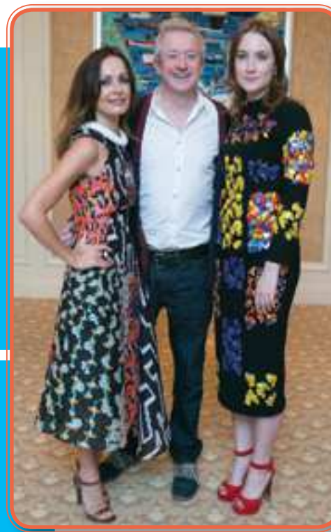
Left: Sharon Corr, Louis Walsh, Saoirse Ronan.

Brown Thomas has been a loyal supporter of the ISPC throughout the years. In addition to the annual lunch, Santa has visited their store each Christmas since 2009. With the support of Canon Ireland, children can visit Santa and have their photo taken with him, with all proceeds going to the ISPC and Christina Noble Foundation. Brown Thomas also donates all proceeds from their Christmas gift wrapping service to both charities. Thank you to both Brown Thomas and Canon Ireland for making this happen!