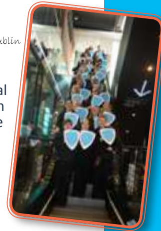
Right: Penneys staff, Mary Street branch, Dublin

The impact of the Emergency Appeal continues to be evident in 2015 with companies electing to support the ISPCC via charity partnership programmes, employee fundraising, matched-giving, company foundations and grants, cause-related marketing, employee payroll and regular giving.