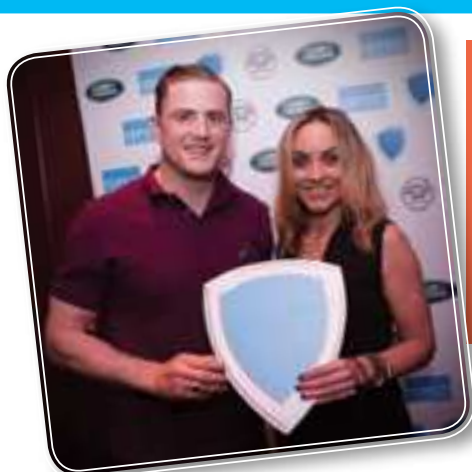
Above: Jamie Heaslip & Kathryn Thomas, holding an ISPC Shield, Bear Restaurant

Jamie Heaslip's Fundraising Dinner at Bear Restaurant Irish International, Lions player and ISPC Shield Ambassador Jamie Heaslip hosted a fundraising dinner at his restaurant Bear, in Dublin on the 25th of March 2014. Jamie was joined by a host of his friends and supporters, making it a must attend event for rugby fans. MC on the night was Kathryn Thomas with a guest appearance from Barry Murphy of Après Match fame. The night kicked off with a cocktail reception, guests then took their seats and enjoyed a three course feast, followed with a celebrity Q&A and raffle. Live music kept the party going into the small hours, with over €18,000 being raised for the ISPC.